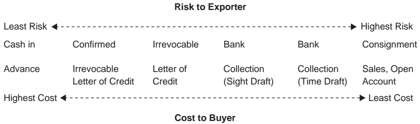
FIGURE 11.1. Export Payment Terms Risk/Cost Tradeoff

Consignment is rarely used between unrelated parties, for example, independent exporters and importers (Goldsmith, 1989). It is best used in cases involving an increasing demand for a product for which a proportioned stock is required to meet such need (Tuller, 1994). It is also used when a seller wants to test-market new products, or test the market in a new country.